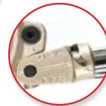
Easy 90° to 180° Switch! No Crossing of Handles!